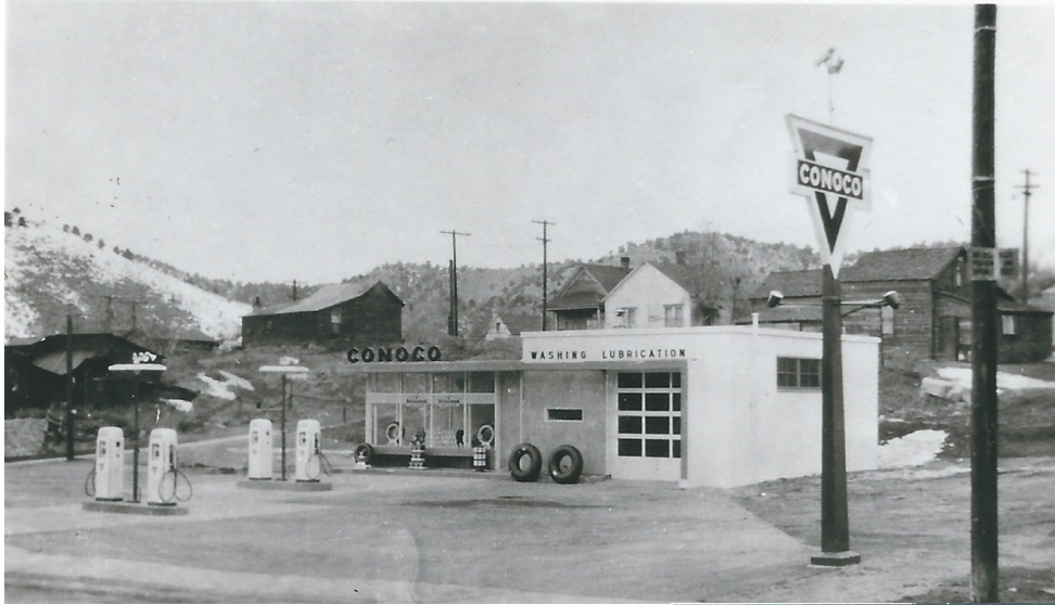
Conoco on Eureka Main Street, now Carpenter's Station.