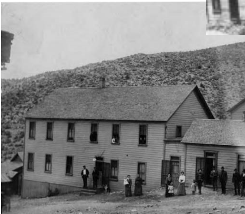
Restaurant and boardinghouse in Mammoth