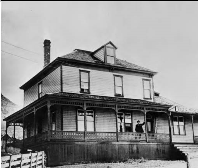
Tintic Hospital in Mammoth