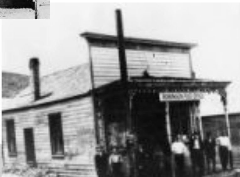
Post Office in Robinson