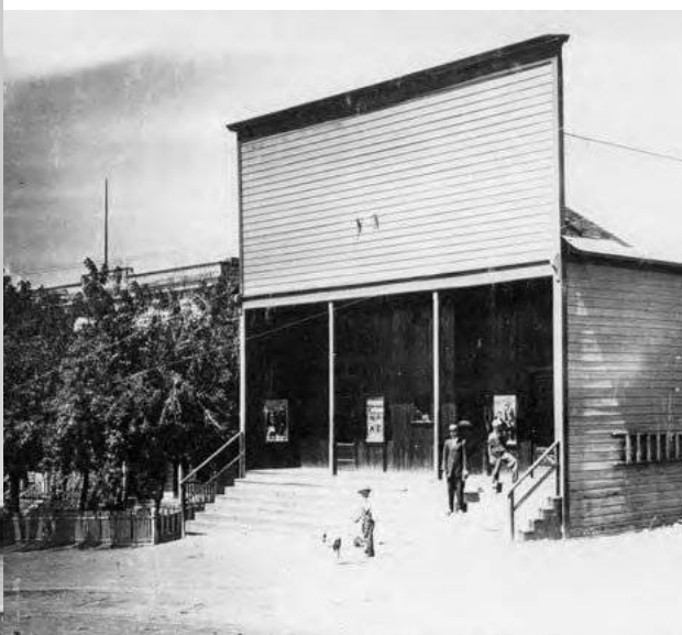
Theater in Robinson